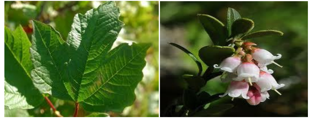
Flowers- White or yellowish flowers are found in groups.

Leaves- The leaves are oblong and conical, 4-6 inch long and 2-3 inch wide, green on the top and brown below.