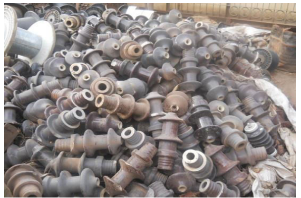
Fig. 2: Ceramic insulator bush waste dump at manufacturing industry