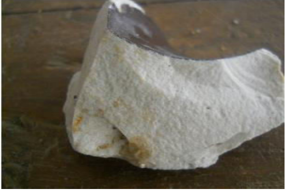
Fig.3: Wide range of pore size grains in the ceramic aggregate

pore structure is compacted and even crushing of these will not wide opens. So, due to this reason water absorption has increased little in ceramic scrap. Ceramic scrap has porcelain cover over the top surface, deglazing was done partially during chiseling and crushing. Partial deglazing of ceramic waste surface is influencing the water absorption property (see Fig 3&4). Table no 1 presents the comparison of physical properties of ceramic waste aggregate and crushed granite coarse aggregate. All the properties were well within the acceptable range for coarse aggregates and hence the ceramic waste aggregate can be safely used in concrete making.