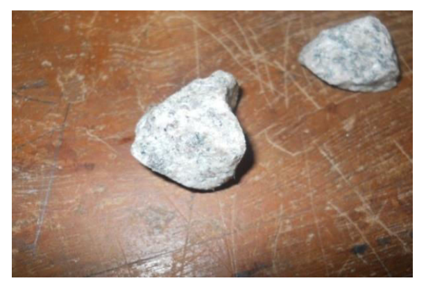
Fig.4: Pore size of the crushed granite aggregate

Table1 comparison of crushed and ceramic waste aggregates