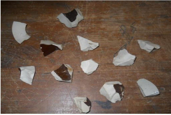
Fig.1: Ceramic waste after crushing to 20 mm size

bats as coarse aggregate in concrete, there was a reduction of concrete strength properties [11]. Replacement of traditional coarse aggregate by ceramic coarse aggregate, the results are promising but under performed slightly in water absorption [12]. Concrete mixes containing recycled ceramic aggregate achieved the strength levels of 80% to 95% as compared to normal conventional concrete [13]. Ceramic aggregates show higher water absorption than limestone aggregate. The mechanical properties of ceramic concrete decreases with increasing of replacement of ceramic aggregate (Hollow clay brick) [14]. The compressive, split tensile and flexural strengths are lowered by 3.8%, 18.2%, and 6% as ceramic waste was used as coarse aggregate [15]. Fig.1 show the crushed ceramic waste obtained from the insulator porcelain ceramic bush and scrap dump shown in Fig. 2 which is used in this study.