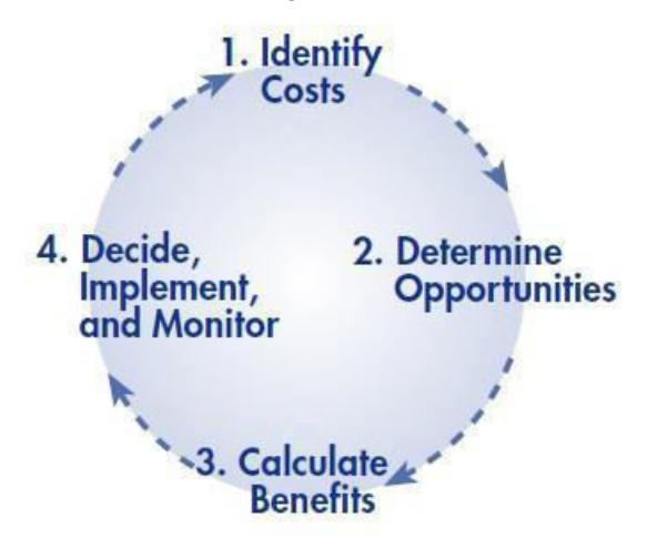
Figure 1 Green supply chain decision making framework

According to Dayna Simpson and Danny Samson (2008), the explosion of GSCM activity in the practical realm has led to an increasing body of empirical work regarding both external influences leading to the uptake of green supply chain management practices, and their impact on firm performance. Investigation in this area has generally fallen into four main categories: