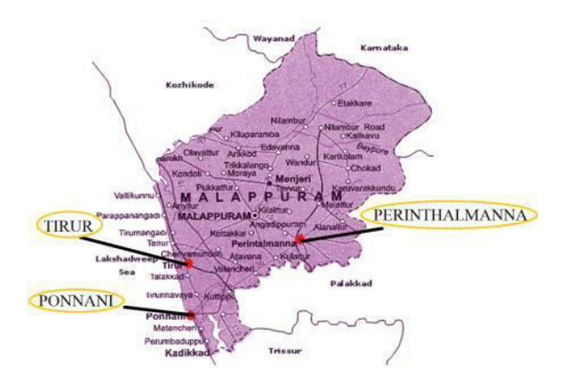
Figure 1. Location Of Selected Medium Sized Towns

The commercial nodes are selected from the towns by analyzing the concentration of commercial land use and the category of commercial nodes in the town. A total of eight commercial nodes are selected from these towns. The details of the selected commercial nodes are given in the table I.