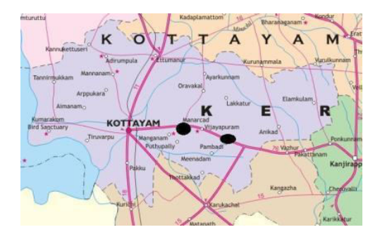
Fig.1 Kottayam District

The selection of the study area plays an important role in finding out the travel behaviour and mode choice behaviour of the commuters. The selected study area was sub-urban regions of Kottayam District. Kottayam is a city in the Indian state of Kerala. It is located in central Kerala and is also the administrative capital of Kottayam district. The areas selected for the study are spotted out in Fig 1 with black marking.