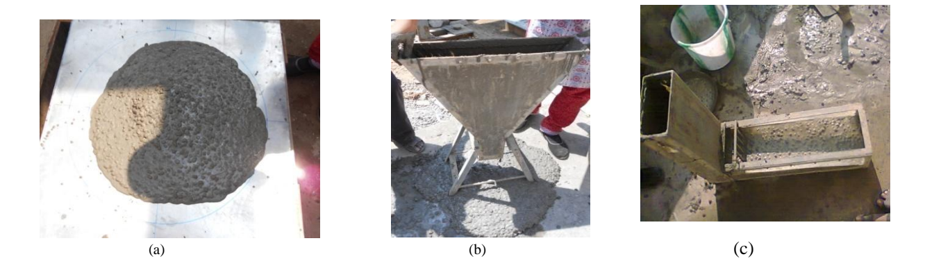
Fig.1, Workability Tests (a) Slump-flow test (b) V-funnel test (c) L-Box test