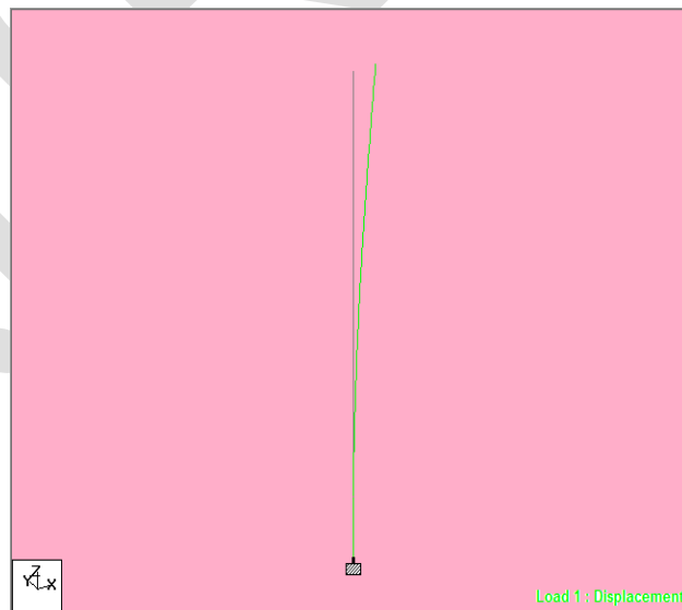
(b) STAAD model of chimney using Line/Beam elements

In the above figure (a) STAAD model of chimney using 8 node solid elements, shows 60m chimney having fixed supports assigned to base elements and the topmost elements are left free to ensure cantilever action. Under the calculated horizontal forces the displacement of this chimney was noted to compare it with chimney model generated using linear/ beam element.