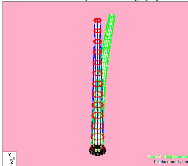
(a) STAAD model of chimney using 8 node solid elements

For generating chimney model in STAAD, two types of models were considered, one with 8 node solid elements and other one with line element. Both the models were analysed and deflection was calculated. It is found that the deflection value for the 8 node solid element model and the linear model are same, so for making the model generation easy linear element was chosen. Mode shapes and frequencies are calculated using STAAD. A factor of 1.2 was multiplied to take in to account of accessories of chimney to its self-weight[10].