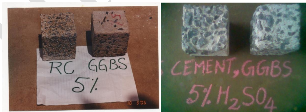
Figs 4.4(a) & (b) Cubes after 10 and 20 days immersed in acid