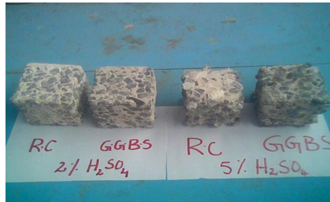
Fig 4.5 Cubes after 30 days immersed in acid

The above figures representing the behaviour of the cubes with and without the addition of GGBS immersed in hydro sulphuric acid. Figs 4.4 (a) & (b) shows cubes immersed in 5% acid for about 20 days. Fig 4.5 shows cubes immersed in 2% and 5% acid for about 30 days.