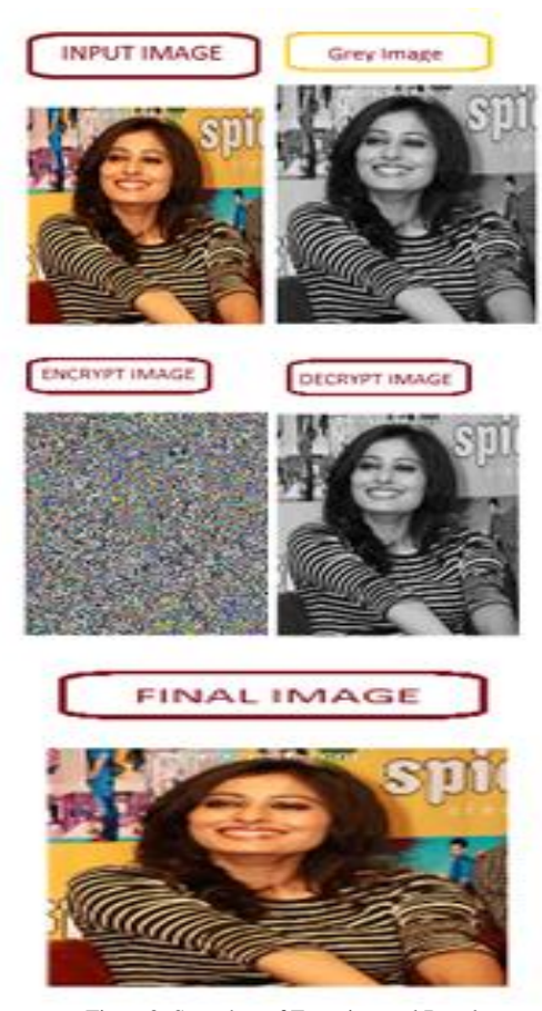
Figure 3: Snapshot of Experimental Results