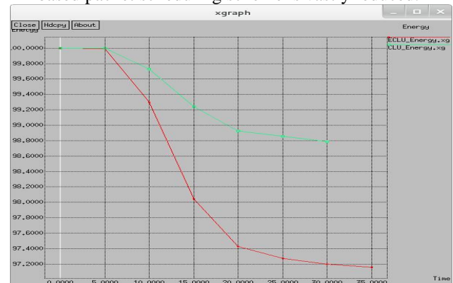
Fig.3. Energy Vs Time plot for FCFS and PB packet scheduling schemes

between the existing and proposed packet scheduling schemes in which the proposed scheme has less energy is consumed when compared with the existing schemes. It demonstrates the energy of all types of data traffic over a number of zones and levels. From these results, we find that the PB task scheduling scheme is very energy efficient and also it outperforms FCFS. This is because in the proposed scheme, FCFS will consume large amount of energy since it processes the data in the order of their arrival time. Thus, the average energy of the proposed PB based packet scheduling scheme is vastly reduced.