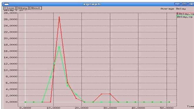
Fig.4. Delay Vs Time plot for FCFS and PB packet scheduling schemes

Packet delivery ratio: Packet delivery ratio is defined as the ratio of number of packets received to the number of packets sent by the server. The below figure shows that the proposed scheme has better packet delivery ratio and it validates our claim that the proposed PB scheme has better packet delivery ratio as when compared to the FCFS scheme.