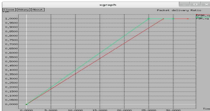
Fig.5. PDR Vs Time plot for FCFS and PB packet scheduling scheme

Packet delivery ratio: Packet delivery ratio is defined as the ratio of number of packets received to the number of packets sent by the server. The below figure shows that the proposed scheme has better packet delivery ratio and it validates our claim that the proposed PB scheme has better packet delivery ratio as when compared to the FCFS scheme.