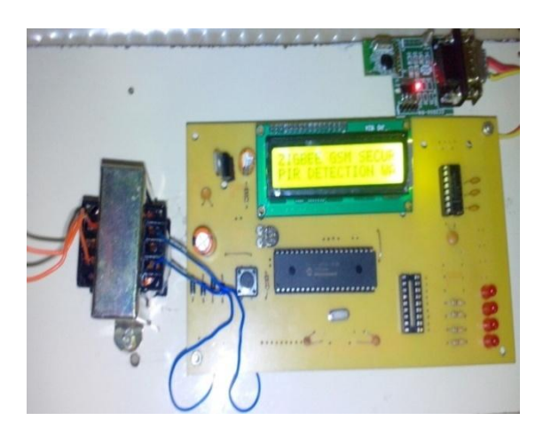
Fig.3LCD display showing intrusion detection

Then accordingly gas valve is controlled by the user. If there is a reply SMS from the user, the GSM module communicates with MCU in the same manner, but in reverse direction. The mobile phone number is first scanned, if it is authorized, MCU sends a message to the ZC which in turn sends information wirelessly to the gas valve with help of the socket through ZED.