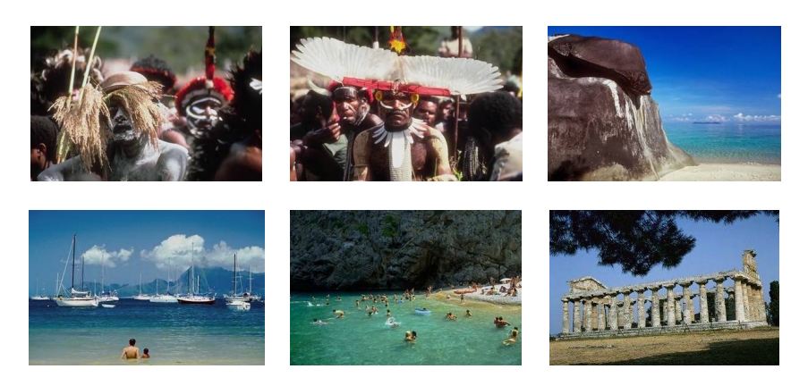
Fig.1. Sample images from benchmark database

(An ISO 3297: 2007 Certified Organization) Vol. 3, Issue 1, January 2014