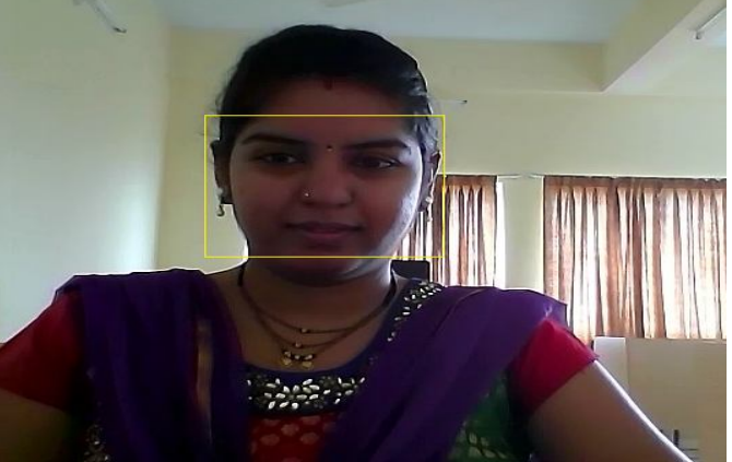
Fig 2(a): Detected Face