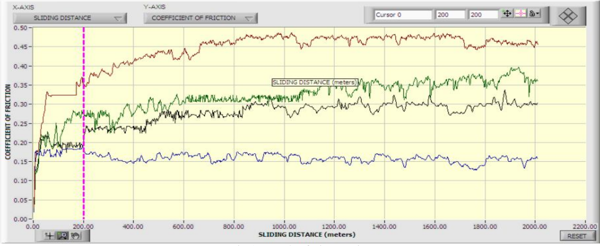
Fig.3. Result of Pin on Disc

After the measurement of hardness, the substrates are subjected to a wear test. A pin on disc tester is used to find out the wear resistance of the material. This test is carried out in both coated and uncoated surfaces so that the efficiency of the wear resistance of the coated material over the uncoated material can be determined. Usually, Wear resistance of the material depends highly on the coefficient of friction. By the pin on disc test we can easily find out the coefficient of friction, wear volume and wear rate of the material which is shown in the Fig.3.