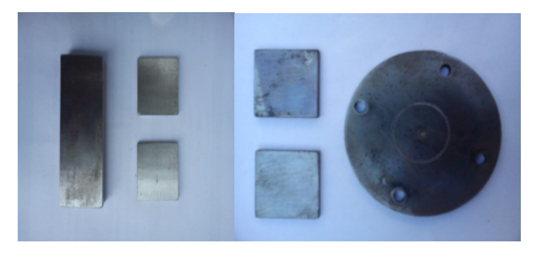
Fig 1a &1b Sample Substrate Material before and after coating.

A Magnetron-sputtered deposition method is carried out under the Working temperature ranging from 200-300^{\circ} c and a Working pressure of 0.5-1 pa at a Deposition speed of 0.1\mu m/min. Titanium aluminium nitride is selected as the coating material because of its very good resistance to oxidation and wear which is shown in Fig 1a & 1b. In order to characterize the coating and its effects, further methodology investigations like presence of coating is identified using X- ray diffraction method (XRD), the evaluation of adhesion of coating over the substrate is made using the scratch tester, and microhardness is tested using the Vickers hardness tester, Wear resistance test is carried out on pin-on-disc machine. Finally the characterization values of the coated and uncoated materials is compared and correlated to find out whether the surface property of the material has improved or not.