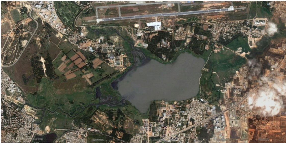
Figure 1. Satellite view of Bellandur Lake and its surrounding

downstream of the lake, heavy foaming is visible, indicative of the presence of effluents [8]. Satellite view of Bellandur lake and its surrounding shown in Fig. 1. Research work has been carried out to understand the pollution (physic-chemical) status of lake.