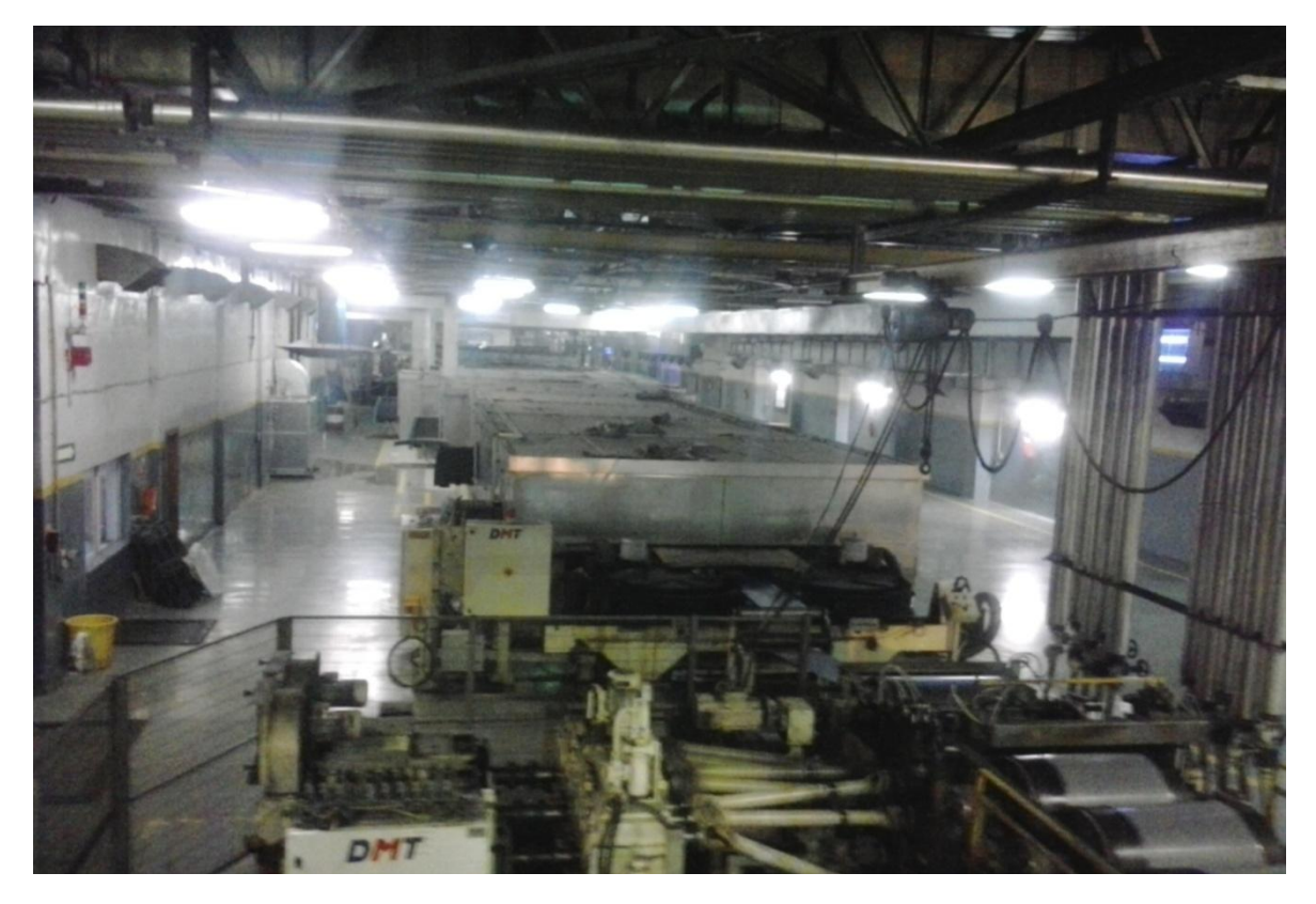
Fig. 4 Transverse direction orientation (TDO) before modification.

So it is observed that the heating for TDO unit in Bruckner lines is provided by oil heating and by electrical heating in DMT lines.