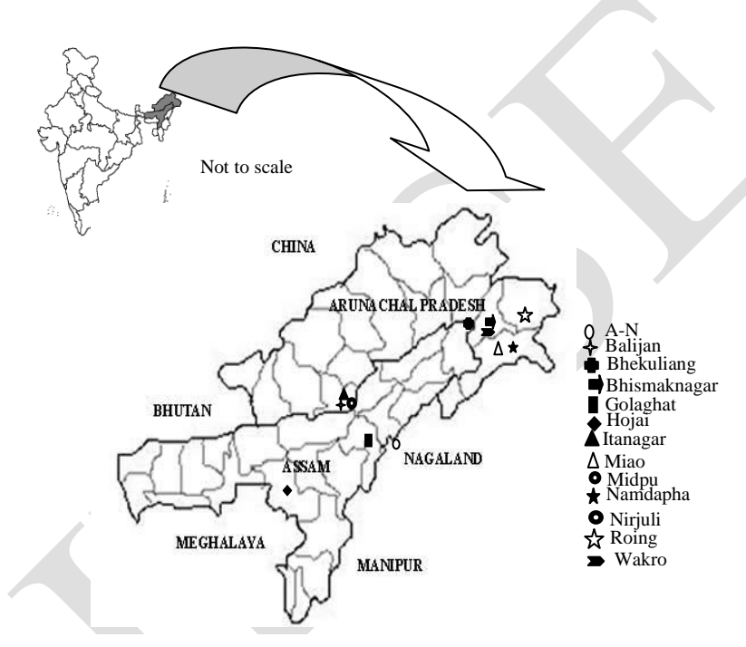
Figure 1: Map showing different study sites in Arunachal Pradesh and Assam, Northeast India

were collected (Table 1). Secondary information from all these sites was collected on the basis of available literature, through personal contacts and interviews with local people. The population studies, however, were carried out at two natural Aquilaria growing sites of Arunachal Pradesh only i.e. Balijan (ARB) of Papum Pare and Namdapha (ARN) of Changlang districts.