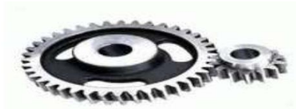
Fig 2 Larger gear connected to smaller gear

As you see in the figure 2 when a smaller gear is connected to a larger gear then you will get larger rpm from the smaller gear by giving even smaller rpm to the larger wheel. Hence by seeing this even when the wheel rotates at smaller rpm you will get more rpm from the smaller gear. Now let us go into our technique, the smaller gear is fixed in the wheel and is connected to a rod and the other end of the rod is connected to another second small gear-like system and that gear system is going to engage and disengage the dynamo's head from it. Now how could we go to replace the problem faced by the dynamo by its inefficiency process? Here is the solution.