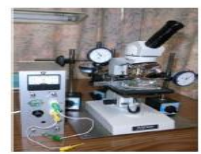
Fig.1. Micro-EDM Machine Set-Up

The experimental set-up shown in the fig.1 has been used to study the micro-EDM process. This set up can be used for both machining and investigating the micro-holes through microscope lenses without removing the work piece from the worktable. The present experimental set-up used to study the micro-EDM process consists of a RC type generator. This generator can produce pulses from few tens of nano-seconds to few micro-seconds. The power supply can vary voltage levels from 45V to 120 V. An Optical microscope is used to investigate the micro-holes formed by micro-EDM set up. Fig. 2 shows a schematic diagram of micro-EDM.