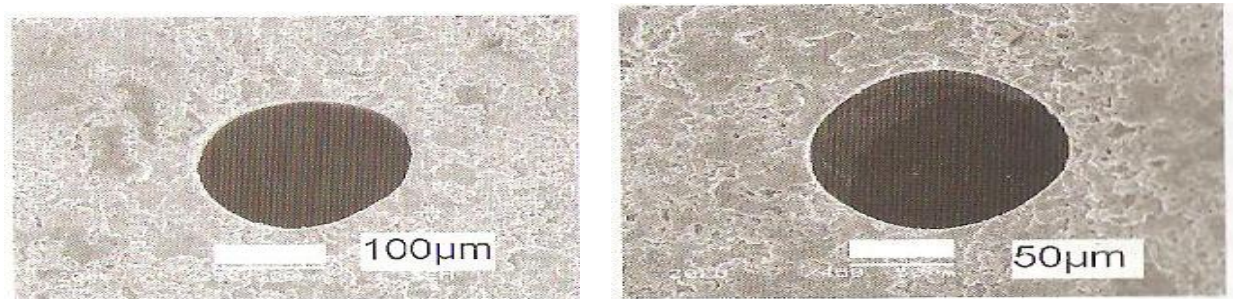
Fig: Micro-holes Shapes at Entrance(left) and exit (right) using 100µm and 50 µm diameter of electrode