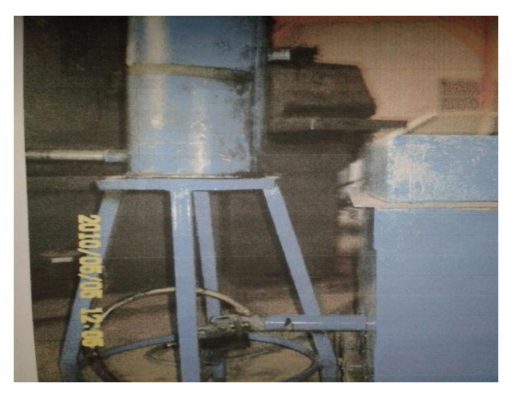
Plate 1: A complete assembly of burner system