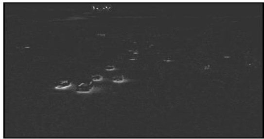
Fig 3: (b) Difference of reference and real time image

The next step is to convert both the reference image and the real time image into grayscale and then the difference of these two images will be found. Since the dimensions of the road are fixed therefore the difference image only highlights the presence of vehicles in the desired area. The difference image is illustrated in Fig. 3(b).