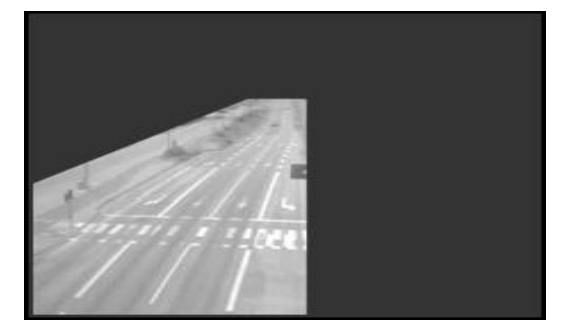
Fig 2: (c) Selection of the target area

Sri Krishna College of Engineering & Technology, Kuniamuthur, Coimbatore-641008, Tamilnadu, India