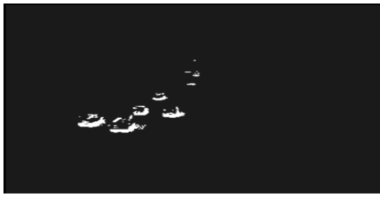
Fig 4: (b) Image highlighting the presence of vehicles in the targeted area