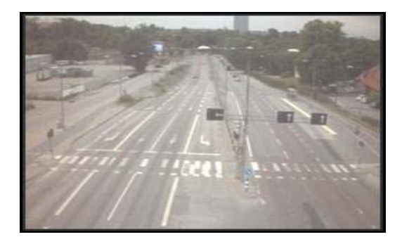
Fig 2: (a) Reference Image taken from the Live Video from [12]

Sri Krishna College of Engineering & Technology, Kuniamuthur, Coimbatore-641008, Tamilnadu, India