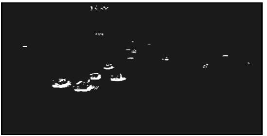
Fig 4: (a) Binarization of the difference Image

4(b). In Fig. 4(b), the unnecessary information is filtered out and it only highlights the presence of vehicles in the desired area.