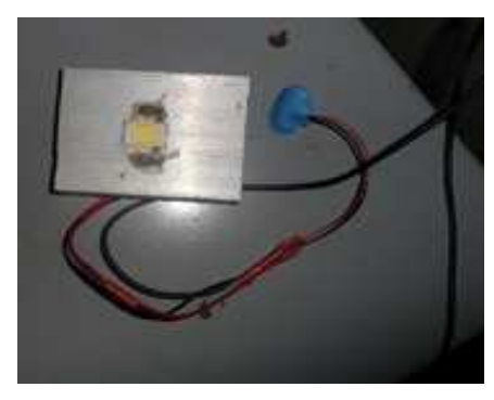
Fig. 3 LED(light-emitting diode)

There are many types like monochromic and polychromic light, depending upon voltage 5V, 9V, and 12V.