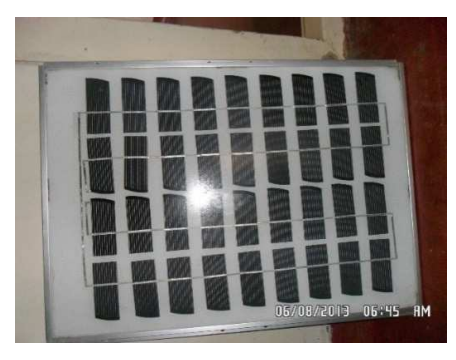
Fig. 4 Solar Panel

A solar panel is a set of solar photovoltaic modules electrically connected and mounted on a supporting structure (as shown in Fig. 4). A photovoltaic module is a packaged, connected assembly of solar cells. The solar panel can be used as a component of a larger photovoltaic system to generate and supply electricity in commercial and residential applications. Each module is rated by its DC output power under standard test conditions (STC), and typically ranges from 100 to 320 watts.