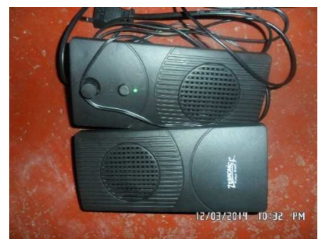
Fig. 5 Speaker

speaker. The dynamic speaker operates on the same basic principle as a dynamic microphone. When an ac current (i.e., electrical audio signal input) is applied through the voice coil that surrounds a magnet (or that is surrounded by a permanent magnet), the coil is forced back and forth due to Faraday's law, which causes the paper cone attached to the coil to respond with a back-and-forth motion that creates sound waves.