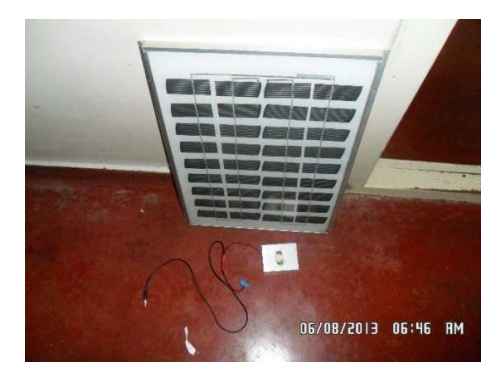
Fig. 2 Example for proposed system

The kind of data to be transmission is connected to LED through serial connection. In the receiving side solar panel is to receive the data in kind of voltage. Example: let take audio as input data which transmits through LED, in receiving side solar panel receive data in voltage with amplified output is connection to speaker where the data is received completely.