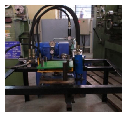
Figure 1.7 Front View Of Assembled Model