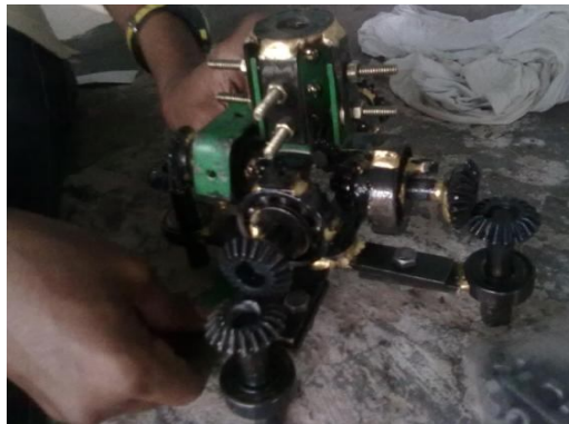
Fig. 2 Assembled View of the projec

Bearing seats are assembled on base plates by welding. The gears are mounted on the output shafts with the help of key. The spring and auxiliary shaft are inserted in the output shaft and the nut is tightened. The Bearings are fitted in their respective shafts. The lock nuts are welded on the base plates. The gears are welded on the auxiliary shafts. The cam is welded on its shaft. Finally the pinion is assembled on the handle and the base plate of bearing of handle is welded with the base plates of other output shaft bearings. The Assembled View of the project is shown in Fig. 2