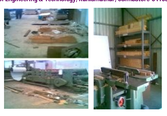
Fig.IV: 5S SEIKETSU APPLICATION AREA

Sri Krishna College of Engineering & Technology, Kuniamuthur, Coimbatore-641008, Tamilnadu, India