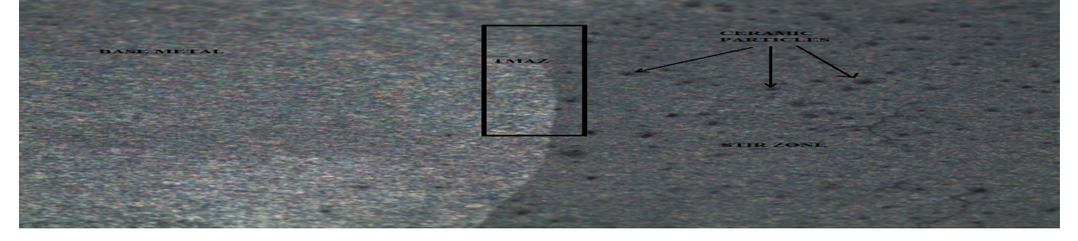
Fig 5:PHOTOMICROGRAPH OF FSPed ALUMINIUM PLATE WITH CERAMIC PARTICLE

Optical micrography is observed for the etched specimen at various processed zones. The surface composite layer appears to be very well bonded to the aluminium alloy substrate and no defects are visible at the interface. A narrow thermo mechanically affected zone (TMAZ) is observed. The frictional heat generated by the rotating tool and application of high stresses during FSP lead to stretching of Al<sub>2</sub>O<sub>3</sub> and AlN particles along the shear stress directions.