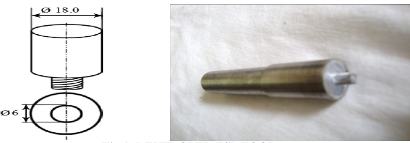
Fig 1: DEVELOPED FSP TOOL