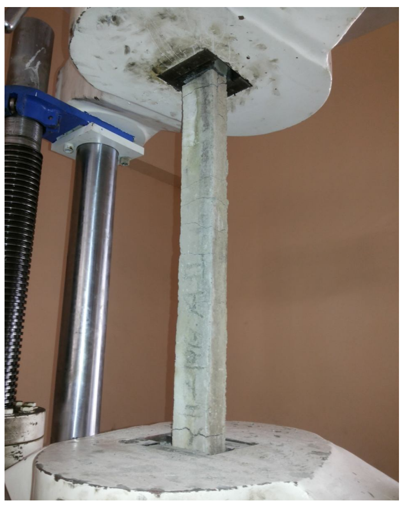
Figure 1: Typical Setup for Tensile test

Department of CIVIL, CE, ETC, MECHNICAL, MECHNICAL SAND, IT Engg. Of Vishwabharati Academy's College of engineering, Ahmednagar, Maharastra, India