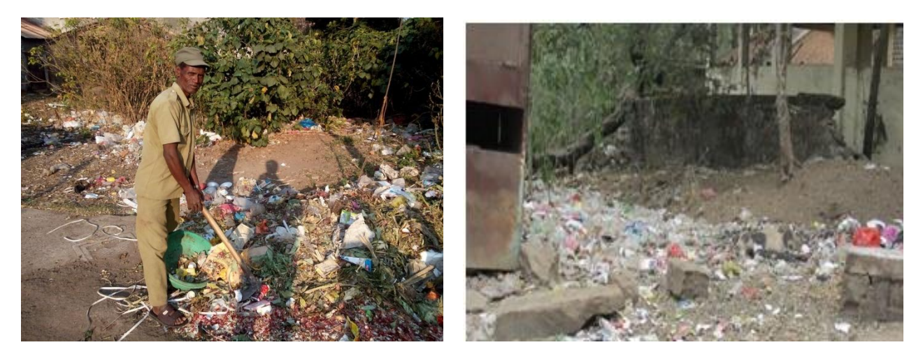
Fig. 3. Open dumping and collection area along road side

Sweeping in the main and commercial area is done regularly and fairly well whereas in the adjacent slum areas, it is neither daily nor regular. Waste collection from main area is done regularly, but residents, particularly from low income groups and shopkeepers frequently throw their waste onto streets and roads and into open spaces and open drains after collection time. In BMC 18 places were observed, where a resident, shopkeepers throws their waste, which causes littering along the road causes clogging of drainage system (fig. 2). To avoid this problem, BMC should provide collection bins at all 18 places which will avoid littering of waste. In addition BMC should plan for waste collection considering working hours of people and notify residents of the time of waste collection to avoid littering and introduce fines for throwing waste on roads or streets, or in open drains.