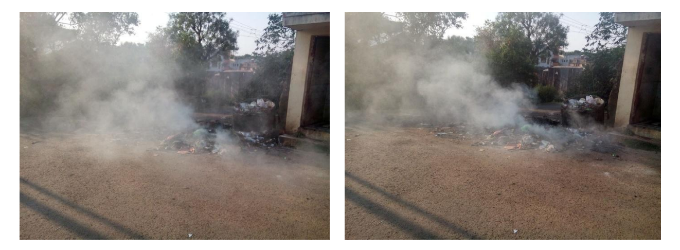
Fig. 2. Open areas along road side where resident throws and burn their waste

Study and analysis of present solid waste management practices by BMC shows that there are many gaps that need to be addressed to make it effective, efficient and economical. Major problems are discussed here and possible solutions proposed.