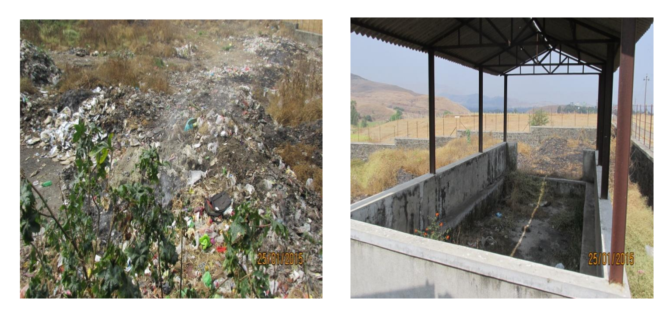
Fig. 4. open dumping site for final disposal and unused composting unit.

At present, no treatment is provided for collected municipal solid waste. Almost 100 % of the waste collected directly disposed in landfill in an unsatisfactory manner and burnt after drying. This method of dumping has led to leachate problem. Further open burning of waste led to ambient air pollution. Two composting plants having volume of 60.92 m<sup>3</sup> are available but not utilized for treatment (fig. 4). This might be due to non availability of technical manpower. Further, unscientific disposal methods not only cause adverse effects on the environment and on human health, but also decrease land availability for disposal and other uses. Almost 60 % portion of MSW is biodegradable. Material and energy recovery is best option for efficient, effective and economical solid waste management system [6].