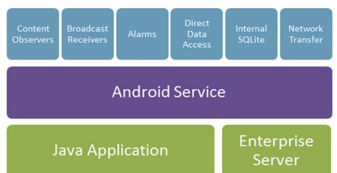
Fig 1:Framework Architecture. The framework uses Content Observers ,Broadcast Receivers , Alarms and stores all the data in the internal SQLite database. All of this is initiated by an Android Service, over a Java Application and Enterprise Server, to transfer data to an external server if necessary.

The general architecture of the application[1] is shown below-