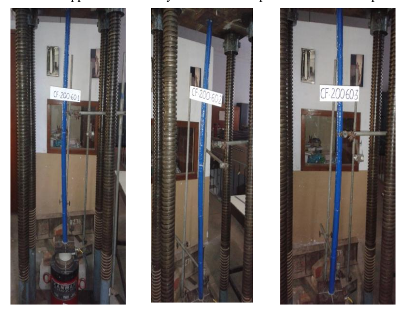
Fig. 6 Failure mode of CF-200-60-1 Fig. 7 Failure mode of CF-200-60-2 Fig. 8 Failure mode of CF-200-60-3

arresting the lateral deformation was moderate due to slenderness of the columns. The maximum lateral deformation of control specimen was 18.2mm at the ultimate load of 82 kN. But this lateral deformation was controlled to 10.88mm in case of CFST columns wrapped with three layers of CFRP strips of 300mm width spaced at 100mm.