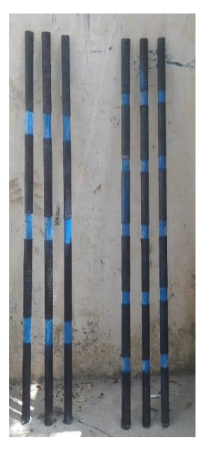
Fig. 1 Sand blasted specimens