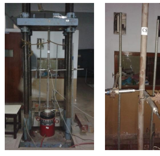
Fig.4 Experimental set up Fig.5 Failure mode of CS