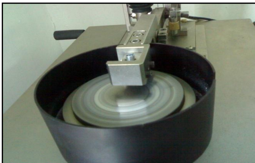
Fig. 2: Pin on disc wear testing machine [21]

The tests perform under dry and lubricated conditions as per ASTM G99-95 standard. The pin at first cleans with acetone and weighed precisely by a digital electronic balance [17]. Throughout the test, the pin is held pushed touching a rotating steel disc (hardness of 65HRC) by applying load so as to acts as counterweight and balances the pin. The track diameter was varied for each batch of experiments in the range of 70 mm to 110 mm and the parameters such as the load, sliding speed and sliding distance are varies in the ranges known [18]. The difference between the first and last weights is measure of slide wear loss. For every condition, tests perform and the average value of weight loss is reported [19].