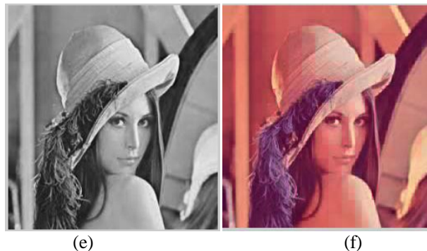
Fig.3 (e)Combination of RGB plane after finding mean and variance (f)Final image similar as original image

The above fig. shows the results for separated planes of original image. Fig(a) shows the original image that is taken for experiment. Fig(b) shows the separated red plane of original image. Fig(c) shows the separated green plane of original image. Fig(d) shows the separated blue plane of original image. The matrix values of these images has been taken to find out trichromatic equations. Which is then used for calculating means and variance according to the equations.