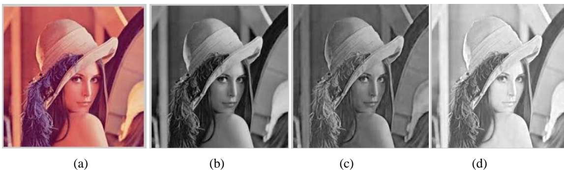
Fig.2 Conversion of three plane into single (a)Original image (b)seperated Red plane (c)seperated Green plane (d) seperated Blue plane