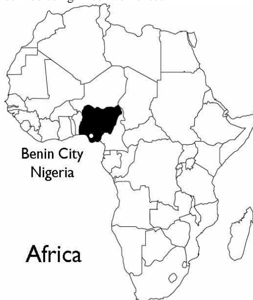
Fig. 1 Map of study location in the continent [9]

The temperature data were obtained from the Rubber Research Institute of Nigeria, Iyanomon; Edo State located at latitude 6.19°N and longitude 5.36° E as shown in Fig. 1. The data consists of the seasonal (dry season) ambient temperature from October 2007 – March 2008. The ambient temperature data were collected through an automated machine which records the ambient temperature reading in every ten minutes (10min). The hourly average measurement is mathematically derived using Excel worksheet.