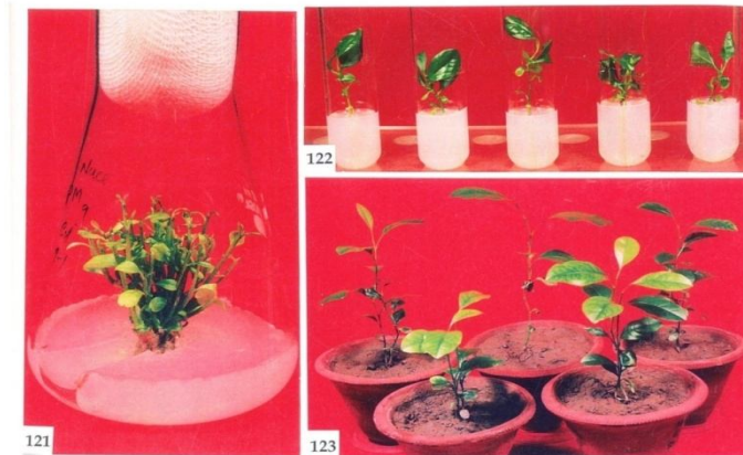
Figs. 121-123: Cultures of Citrus jambhiri