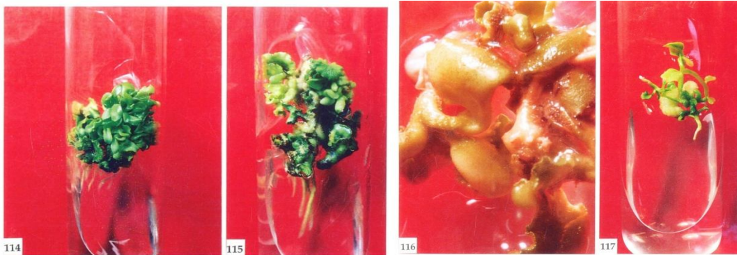
Figs. 114-117: Cultures of Citrus jambhiri