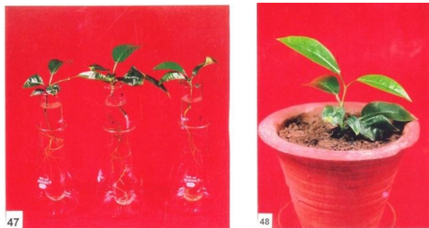
Figs. 47-48: Cultures of Citrus sinensis

Fig. 46: Micrograft of shoot meristem of C. aurantifolia over rooted shoot of C. limonia showing callusing at the juncture of micrograft and regeneration of an axillary shoot from the rootstock