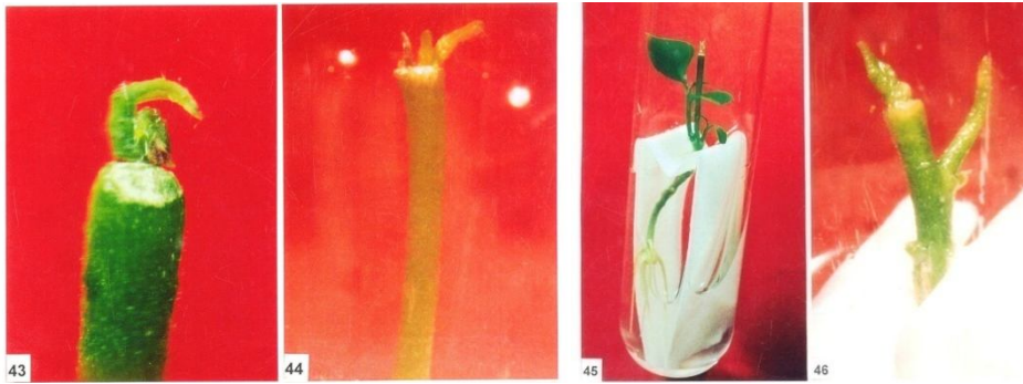
Figs. 43-46: Anomalies associated with micrografting

Fig. 43: Not so perfect union of meristem with the cortical tissue of the rootstock