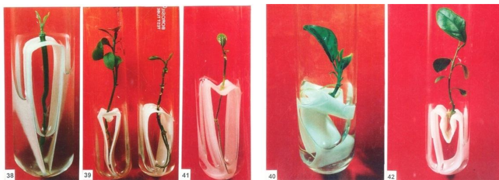
Figs. 38-42: Micrografting in Citrus spp.

Fig. 38: A growing shoot meristem of C. sinensis after ca. 10 days of micrografting over C. minonia