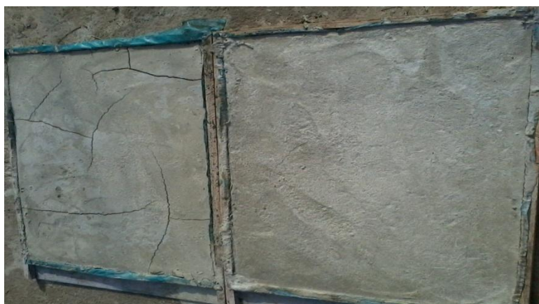
Fig 1 Test specimens after 20 hours of testing

Table 5 shows mix proportion of concrete by weight which is obtained as per IS 456:2000. Here as per mix design ratio of water to cement is 0.48 while fine aggregate is 1.33 and coarse aggregate is 2.96.