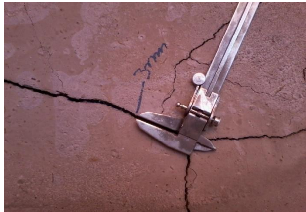
Fig 3 Showing 3mm Crack by help of vernier scale.

Figure 2 & 3 showing close view test specimens after 20 hours of testing. Here Figure 2 shows whole crack thought the panel with different zone of cracking and figure 3 shows individual measurement of crack of 3 mm with the help of vernier scale.