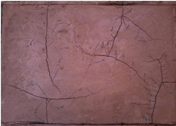
Fig 2 Close view of control panel after 20 hours

Figure 1 showing test specimens after 20 hours of testing. A control panel (left) show maximum cracking. A test panel (right) differs from the control panel in one respect that is to be checked for its effect on changing the cracking. In this particular instance the test panel contains modified polyester (Recron) fibres while the control panel does not.