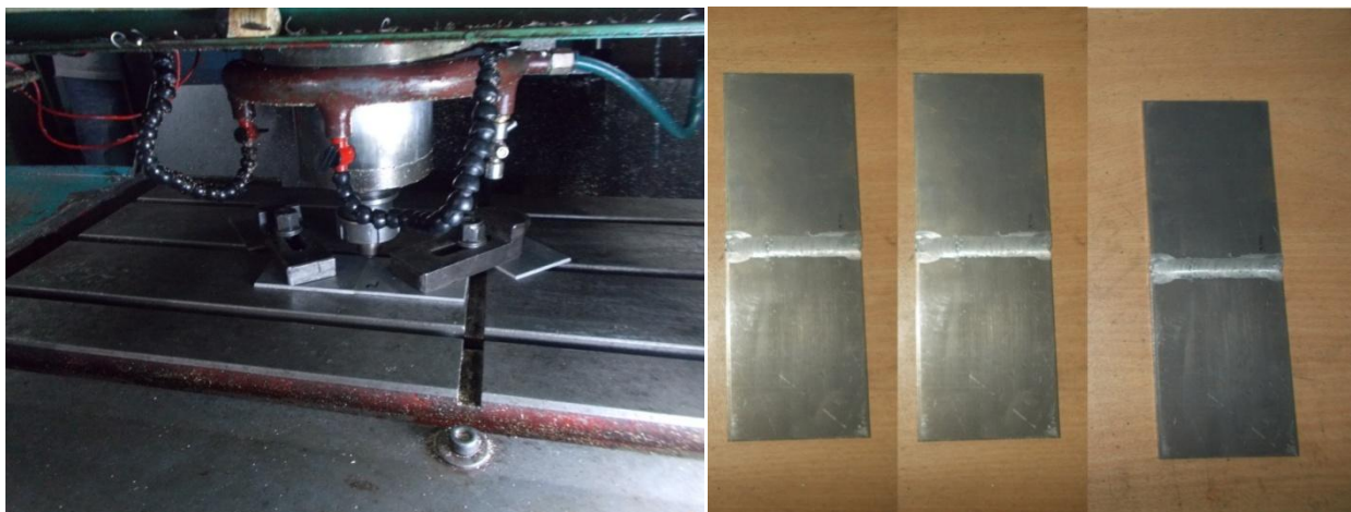
Figure 2 Experimental set up and weld pieces

In present experiment we select 4mm thickness of Aluminium sheet. Aluminium sheet was cut with the dimensions of 4mmx70mmx100mm using shearing machine and the edges of the plate are filed to get smooth surface finish. After the plates are cut into required sizes, fix the plates side by side on work table rigidly by clamps to form butt joint. The tool material selected for this experiment is H13 Tool Steel due to its excellent combination of high toughness and fatigue resistance. Tool profile is threaded pin profile.