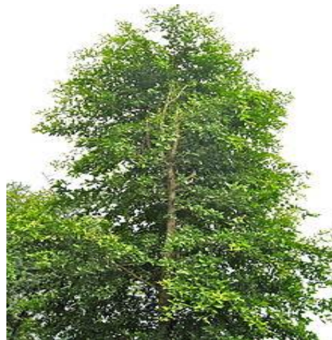
Fig.3 Aegle Marmelos

The recent area of research is concentrated on plant fiber composites, which are blended with resins. The natural fiber composites are seen as potential materials for many engineering applications. Here, the natural fiber taken was Aegle marmelos as shown in fig. 3, which is available in Indian environmental conditions. Aegle marmelos, locally called, as 'Bilva' or 'Maredu' is one such natural resource whose potential as fiber reinforcement in polymer composite has not been explored in complete.