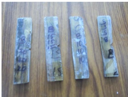
Fig. 5 Aegle Marmelos composite fiber test specimen

The specimens taken were shown in below fig 5. These specimens are of dimensions 67.5mm x 3mm x 10mm with weight% 5, 10, 15, 20 grams.