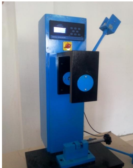
Fig. 4 Kaiser Izod Impact Machine

After fabrication, the test specimens with notch angle 0.5^{\circ} were subjected to impact test as per ASTM standard. The standards followed are ASTM D256 for impact test. Test was carried out using Kaiser Izod impact machine as shown in below fig. 4.