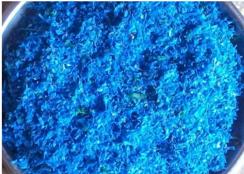
Fig 1: Scraped Plastics

Percentage of plastics (Granular shape) to minimize F.A