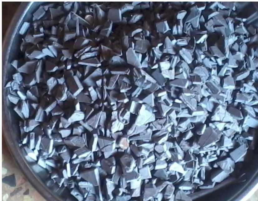
Fig 3: Crushed Plastics (High Density)

Percentage of plastics (Crushed shape) to minimize C.A