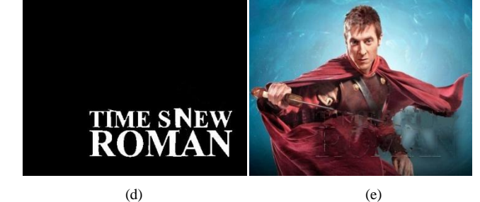
Fig. 2.Text Detection and Inpainting (a) Original image (b) image after applying first set of criteria (c) image after applying second set of criteria (d) Image mask (e) Inpainted image using patch size 4 x 4 and search window size 81 x 81