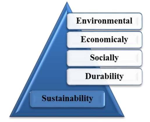
Fig (1) the concept of Sustainability - Design by the author -2015

7- In some cases, as consequence of the trademark image of some companies, the industrial buildingshave a high aesthetic value that contributes to increase the architectonic heritage of the surrounding area