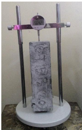
Figure.5 Test result from the apparatus