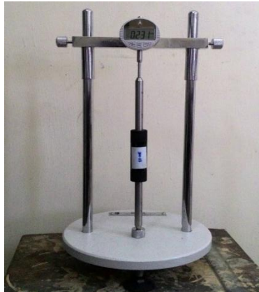
Figure.1 Shrinkage measuring apparatus along with reference rod