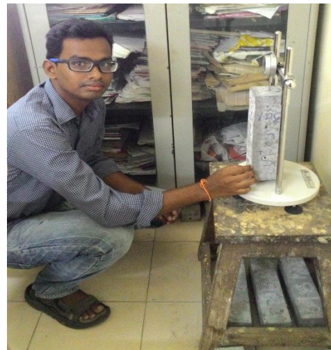
Figure. 6 Obtaining test results from the apparatus