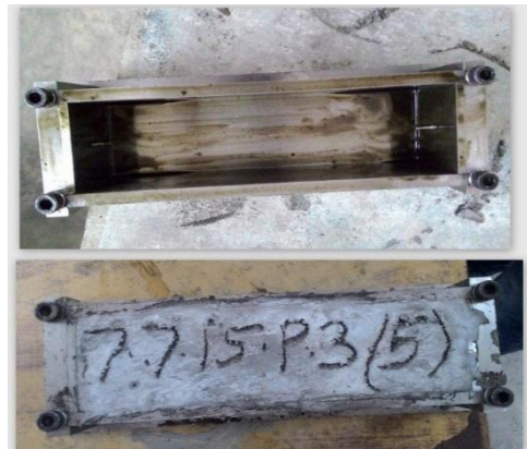
Figure.2 Casting of prismatic moulds

A prismatic concrete specimen of cross section 75mm x 75mm having a gauge length of 285mm were casted with different replacements of cement with sugarcane bagasse ash and constant replacement of silica fume. Gage studs are used on either side of the specimen in order to hold the specimen in the volume change apparatus. Gage studs are placed in such a way that it should coincide with the principle axis of the specimen. 7-days water curing should be done immediately after demoulding and it should be noted as initial reading with help of a digital dial gauge attached to the apparatus. Then the specimens are dried for 60 days. The dial gauge readings are constantly monitored daily up to the specified age of 60 days. The dial gauge readings of 3, 7, 14, 21, 28 and 60 days are taken as final readings. The change in length to the same are calculated. The change in length is the difference between the initial reading and final reading and shrinkage strain to that were calculated.