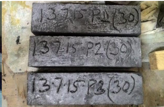
Figure. 4 Prismatic specimens kept for drying