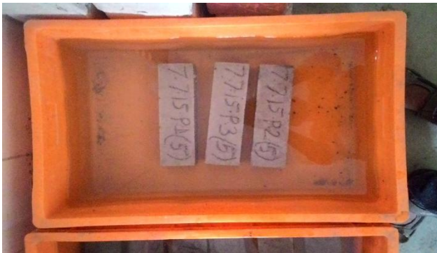
Figure. 3 Prismatic specimens kept for 7 days curing

The materials such as SCBA and SF are mixed for half an hour in order to get a homogeneous mixture. Preparation of specimens are carried out and they are kept for 7 days water curing for initial reading. After taking out specimens from curing they are kept in racks in drying state so that the specimen while shrinkage upon age to the remaining dry readings.