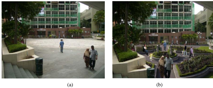
Fig. 1. Buildings should be sited carefully to create defined public space. Build-to lines should be utilized to establish a consistent series of building facades, and to promote regular alignment. The street is an important form of public space, and the buildings that define it should be expected to reinforce and enhance the streetscape corridor, (Figures 1.a and 1.b) showed the existing open space and the open space after the development.

Figures shows the results of the study area. Figs. 1, 2, 3 (a) shows the original image. (b) and (c) is the image obtained by designing and developing the area.