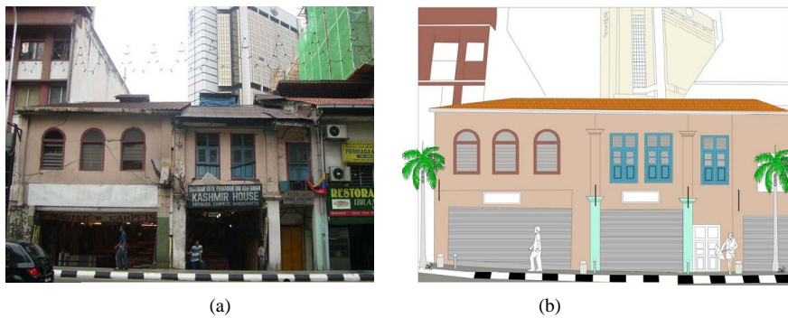
Fig. 2 Conservation is an integral part of urban planning which provides a vital link to past. The importance of building and monument conservation : sensitivity towards the past, emotional ties, continuity and stability of physical surroundings, absence of protection against economic pressure, importance of tourism industry, lower estimated cost of development and financial gain in redevelopment, Several types of conservation actions may take place simultaneously in different parts of the whole building. Several types are identified, Reinforcement is the physical addition or application of materials that strengthen or support the actual fabric of the monument or conservation building to ensure its continued durability or structural integrity .