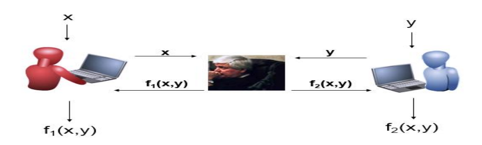
Fig. 1 Ideal System

The Fig 1 of ideal system builds an algorithm for sharing simple integer data on top of secure sum. The sharing algorithm will be used at each iteration of the algorithm for anonymous ID assignment (AIDA). This AIDA algorithm, and the variants that we discuss, can require a variable and unbounded number of iterations. With the help of this system explores the connection between sharing secrets in an anonymous manner, distributed secure multiparty computation and anonymous ID assignment.