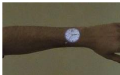
Figure 4. Check the Time

Sixth Sense have to do is sketch a circle on ones wrist is in figure 4 with their index finger to get a actual watch that gives us the correct time. Computer tracks the red marker cap or piece of ape, recognizes the gesture, and instructs the projector to flicker the image of a watch onto their wrist.