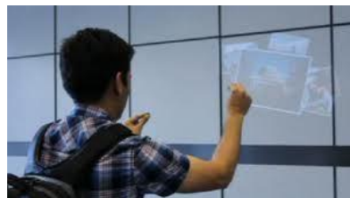
Figure 6. Drawing