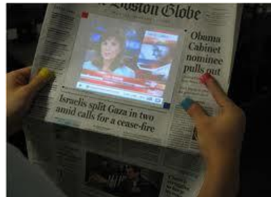
Figure 5. Multimedia Reading