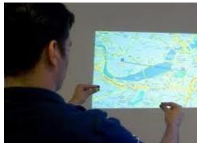
Figure 3. Call up a Map.

Sixth Sense have to do is sketch a circle on ones wrist is in figure 4 with their index finger to get a actual watch that gives us the correct time. Computer tracks the red marker cap or piece of ape, recognizes the gesture, and instructs the projector to flicker the image of a watch onto their wrist.