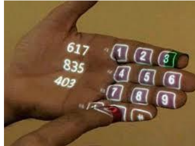
Figure 2. Make a call using hand