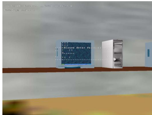
Fig.1. Snapshot of a proof-of-concept 3-D virtual environment, where the user is typing a textual password on a virtual computer as a part of the user’s 3-D password.

(1, 18, 80) Action = Drawing, point = (330, 130). This representation is only an example. In order for a legitimate user to be authenticated, the user has to follow the same sequence and type of actions and interactions toward the objects for the user’s original 3-D password. Fig. 1 shows a virtual computer that accepts textual passwords as a part of a user’s 3-D password. Three-dimensional virtual environments can be designed to include any virtual objects. Therefore, the first building block of the 3-D password system is to design the 3-D virtual environment and to determine what objects the environment will contain. In addition, specifying the object’s properties is part of the system design. The design of the 3-D virtual environment influences the overall password space, usability, and performance of the 3-D password system. Fig. 2 shows a snapshot of an experimental 3-D virtual environment.