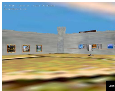
Fig.2. Snapshot of a proof-of-concept virtual art gallery, which contains 36 pictures and six computers

To simplify the idea of how a 3-D password works, Fig. 3 shows a state diagram of a possible 3-D password authentication system.