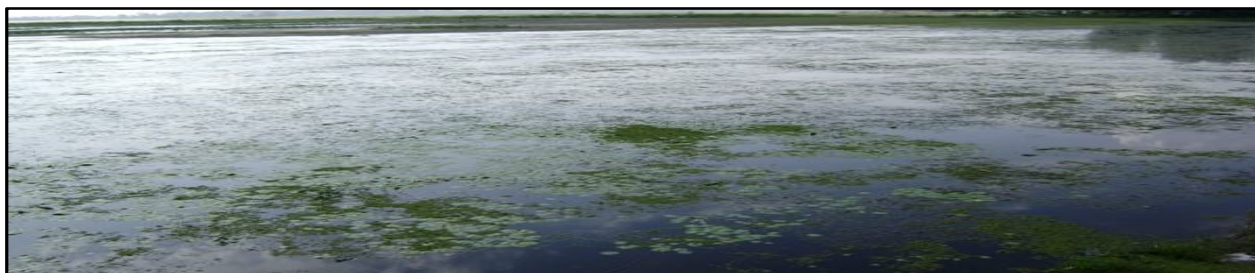
Figure 2 Bluish green colour of Dal Lake(7)

The Colour of Dal lake is more inclined towards Blue-Green which indicates a plankton bloom (Key indicator of a plankton bloom, elevated DO and pH). This Water colour is due to dominant plankton type present.