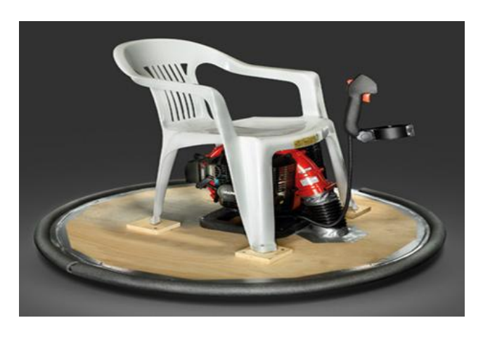
Fig: 2 – Hovercraft

Department of Mechanical Engineering, Magna College of Engineering, Chennai-600055, India.