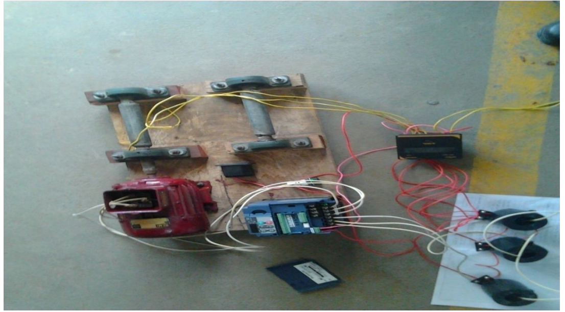
Fig 2.Experimental setup built

The motor design frequency is usually 50 or 60 cycles. When a VFD drives a motor, it is usually to control the motor speed.