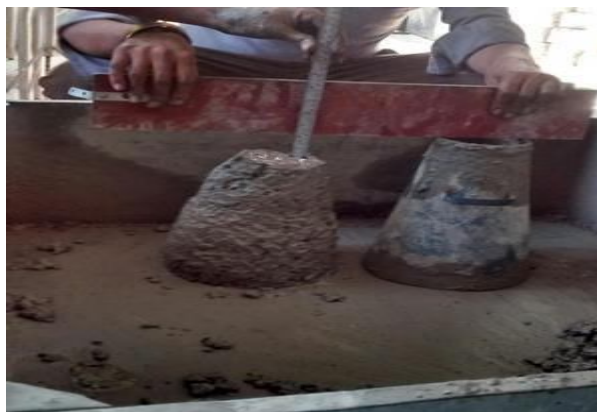
Fig. 1 Workability Measured by Slump Test

The workability of PPC concrete was determined by the slump test. Workability is used to describe the ease or difficulty with which the concrete is mixing, compacting and placing between the forms with minimum loss of homogeneity. The slump test shows the behavior of a compacted concrete cone under the action of gravitational forces. Slump test were used to gauge the workability of mixed concrete. The slump values of concrete for different percentage of fly ash and corresponding dose of super plasticizer is given in table 3