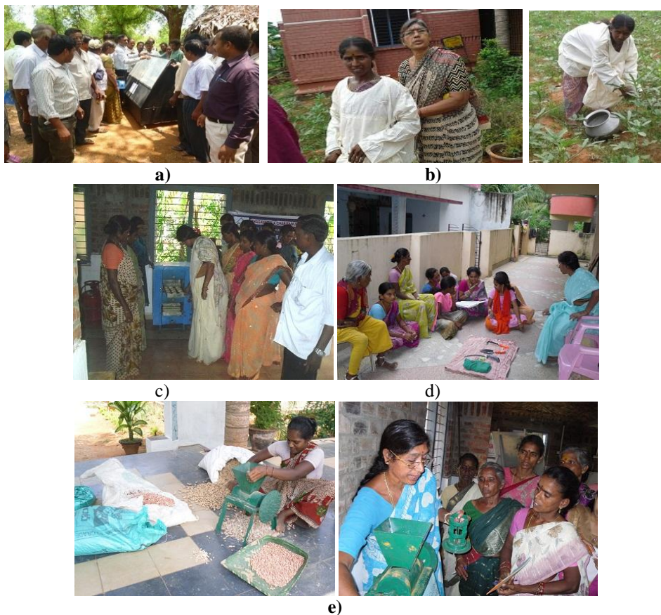
Fig 1. a) Solar dryer for drying of fish b) Cotton bags and Bhendi Pluckers for drudgery reduction of women c) Gas based bakery oven d) Drudgery Reduction small implements e) 3in1Decicator for Groundnut, Maize and Sunflower

As an Agriculture and allied activities leading to Rural Human Resource development, Women can be trained in the following Agricultural Machines.